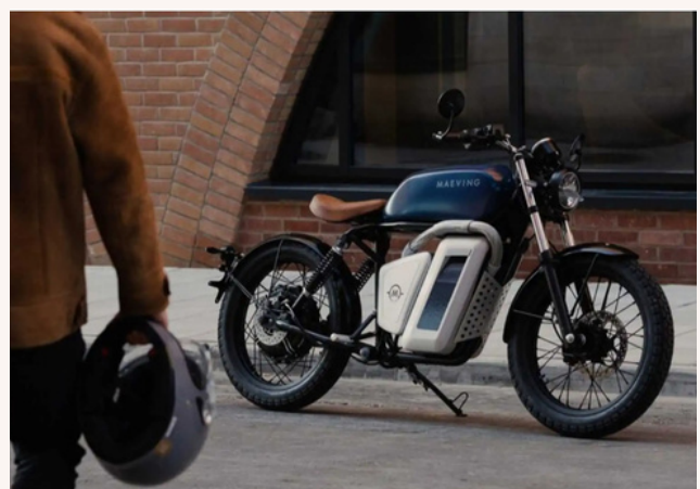
Maeving electric motorcycle.