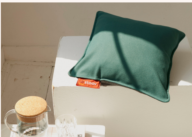
Stoov electric heated cushion.

We know on pack promotions engage audiences. But they still need to set your brand apart. Why not offer a luxury option to address the cost of living crisis? Aspirational, relevant and eye catching.